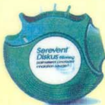
Serevent Diskus® salmeterol xinafoate inhalation powder