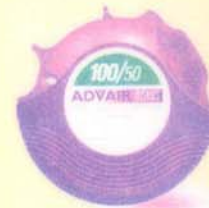
Advair Diskus® fluticasone propionate/ salmeterol inhalation powder