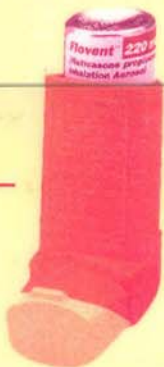
Flovent® fluticasone propionate