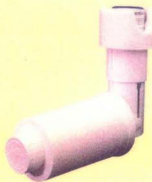
Azmacort® triamcinolone acetonide